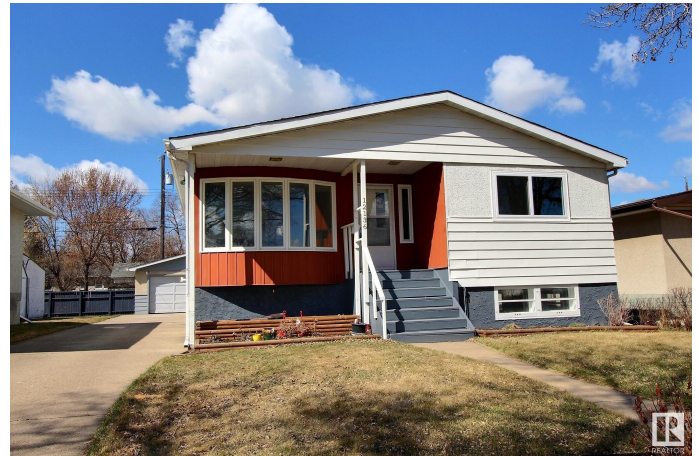
12136 38 St NW, Edmonton, AB

MLS® # E4428099 Price $385,000 Bedrooms 5 Bathrooms 2.00